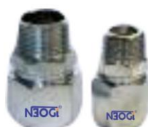
Hose Coupling 50 & 40 mm