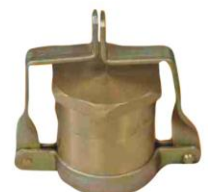
Dip Cap Assy Brass with locking arrangement