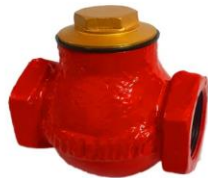
Horizontal Check Valve