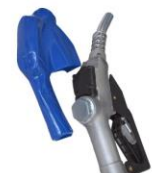
Auto Cut off Nozzle