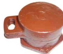
Fill Cap Assy