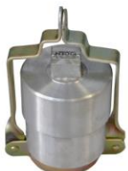
Dip Cap Assy 2" Floating Type with locking arrangement