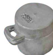
Dip Cap Assy 2"/"1.5 "