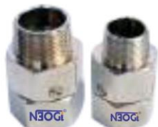
Swivel Joint 50 & 40 mm