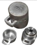
Floating Type Dip Cap (Alu)