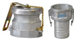
Camlock Coupling (Male & Female)