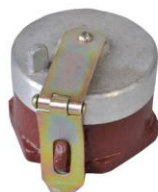
Dip Cap CI body Alu Cap